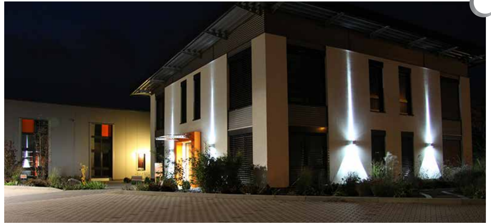
Low energy lamps thanks to the latest LED technology

A Van der Heijden cooler always pays off!