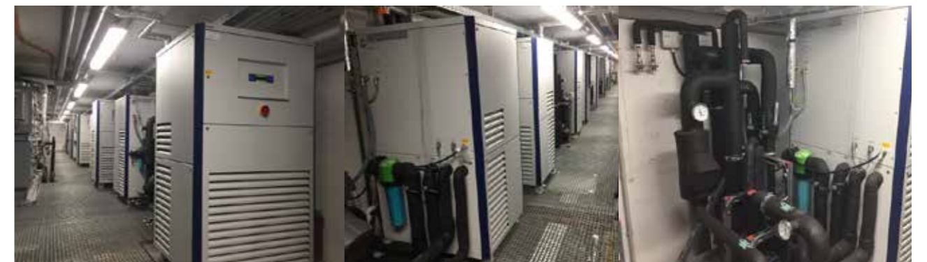
Customer project - technical center with system separators