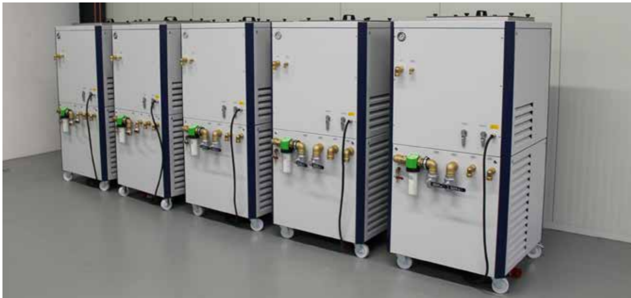
80 kW system separator with filter on the secondary side

These systems can achieve much higher cooling capacities (up to 150 kW) and are much quieter (hardly any vibrations) and have very low operating costs, especially when the cooling capacity increases. The devices are very compact because there is no compressor.