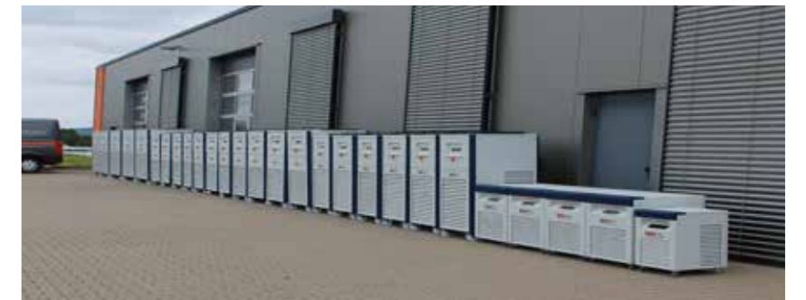
General delivery for Huber USA

Whether special solutions with multiple distribution on the device or temperature control units made of stainless steel with ramp function - we modify our coolers in such a way that they exactly match your application and the conditions on site!