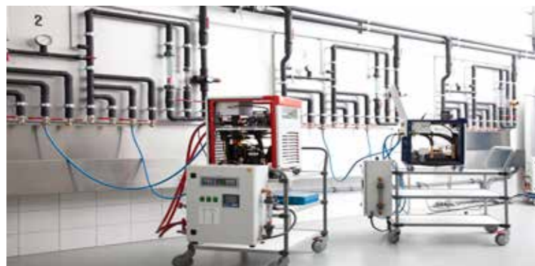
Our test room for system separators and WC-systems