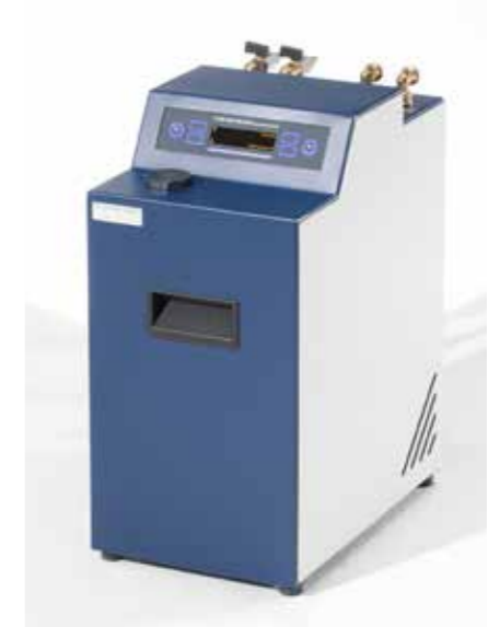
System Separator 9 kW

There are only two more water connections on the back of the unit, which are used to connect to the existing house cooling or water pipes.