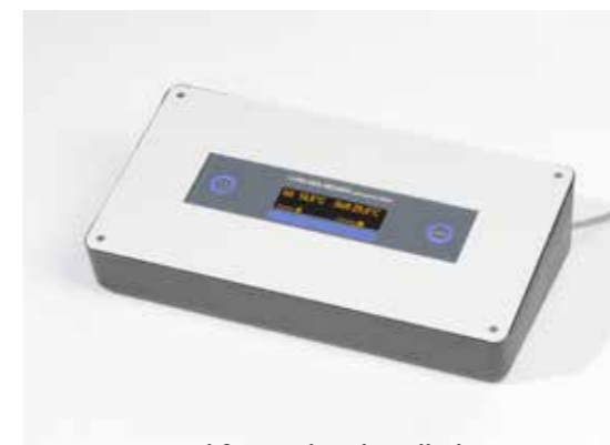
Remote control for outdoor installation