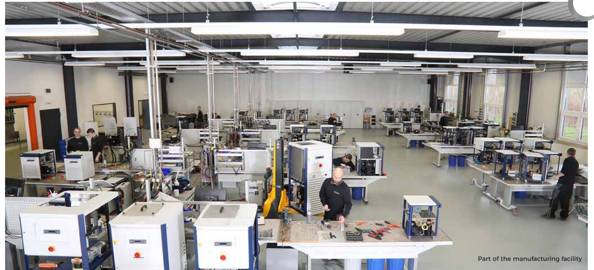
Part of the manufacturing facility

In the end, a higher purchase price pays off due to the long service life and low failure rate.