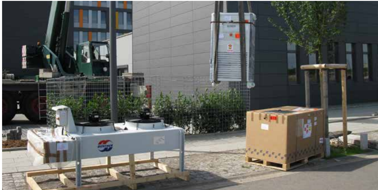
30 kW split system for roof mounting

Many institutes already have their own domestic cooling water supply. This cooling water is generally too cold to cool a laser or an electron microscope, or the water quality is simply too poor.