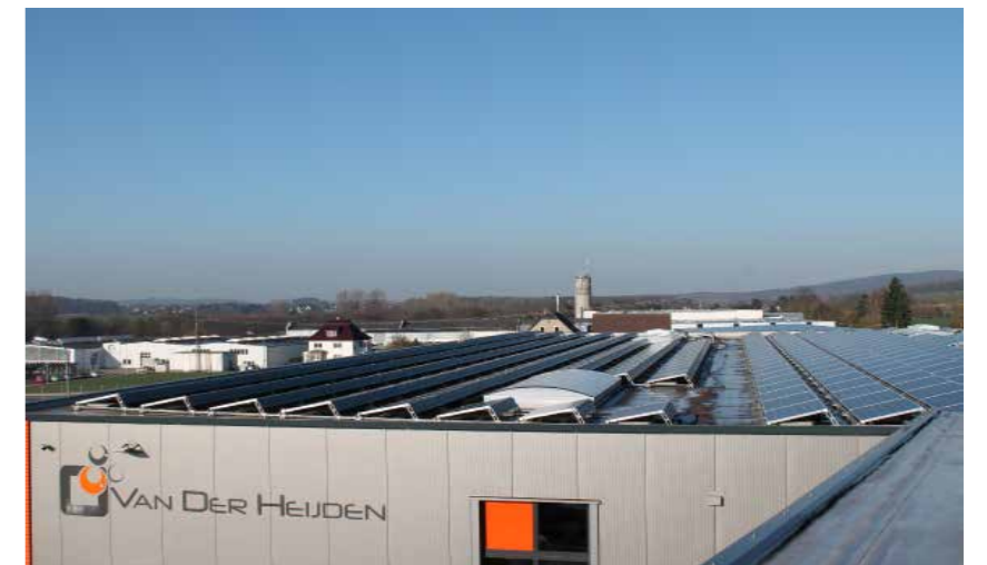
Ecological electricity generation

Our customers want to save water and energy, we develop our laboratory coolers to maximize this and at the same time try to keep prices competitive.