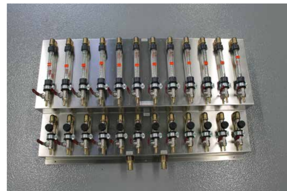
External 12-way distributor to a 50 kW system separator