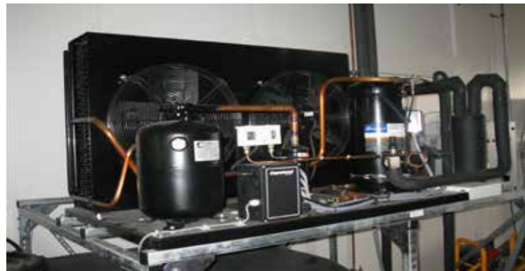
Heat recovery in the test room