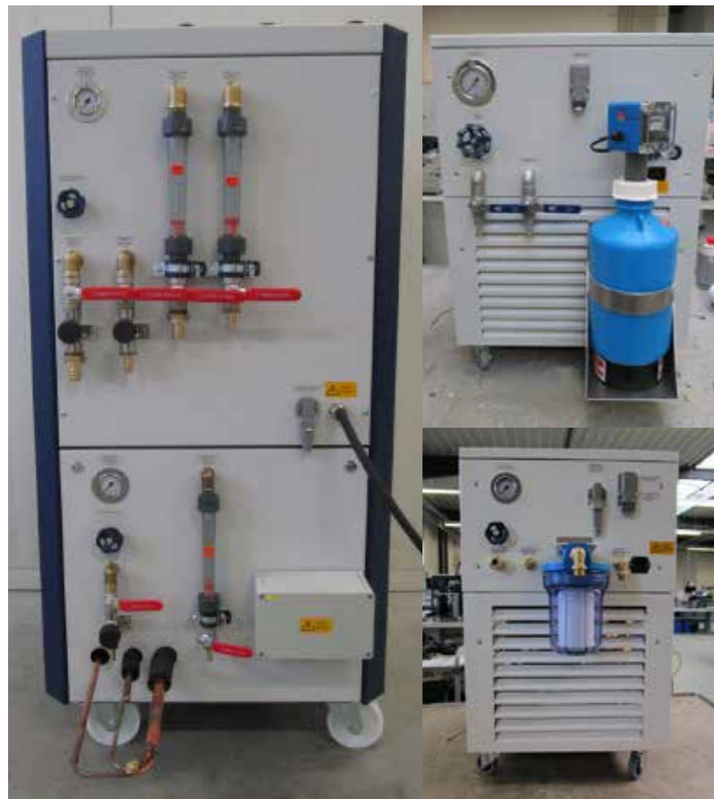
Examples of special construction

Very high quality, powerful, reliable and robust low-cost liquid coolers, made specifically for your application (from a flexible range of options), of high quality at an affordable price.